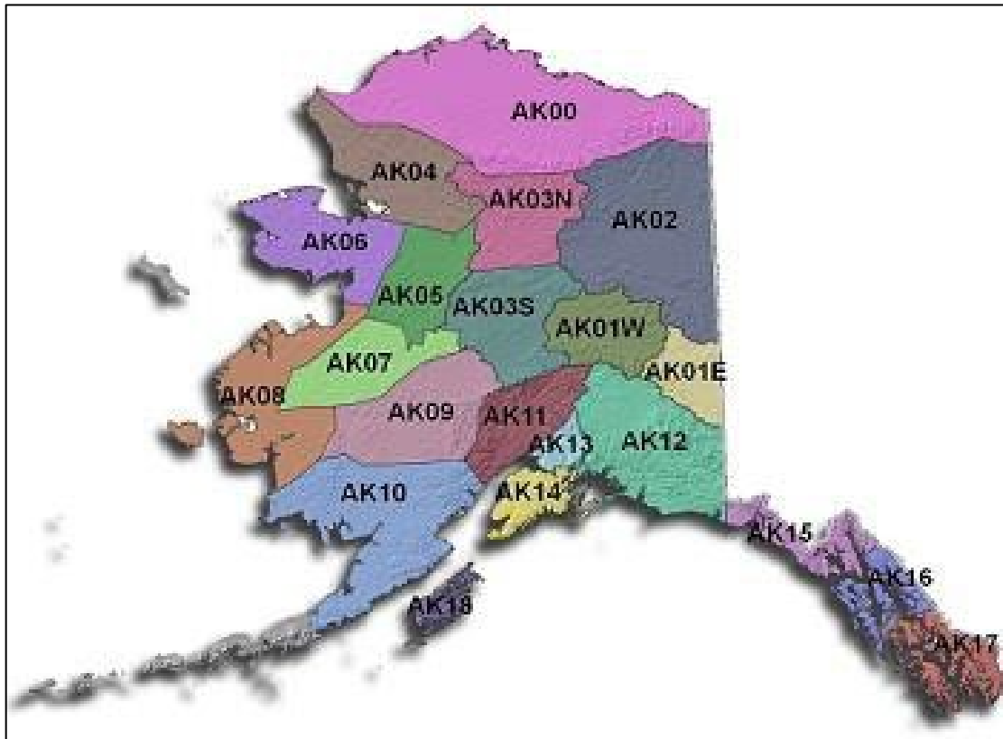
Figure 3. Alaska Predictive Service Areas